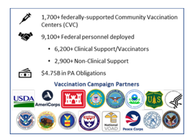
Figure 2. Federal Vaccination Campaign Support as of April 30, 2021

When SLTT partners are overwhelmed, FEMA is prepared and postured to provide the lifesaving, life-sustaining capabilities that have customarily been available from FEMA in support of states, tribal nations, and territories. FEMA will reprioritize resources as needed for emerging incidents while maintaining operational support to SLTT partners. After initial response, FEMA will continue to coordinate with SLTT partners to identify sustainable long-term staffing solutions, if necessary.