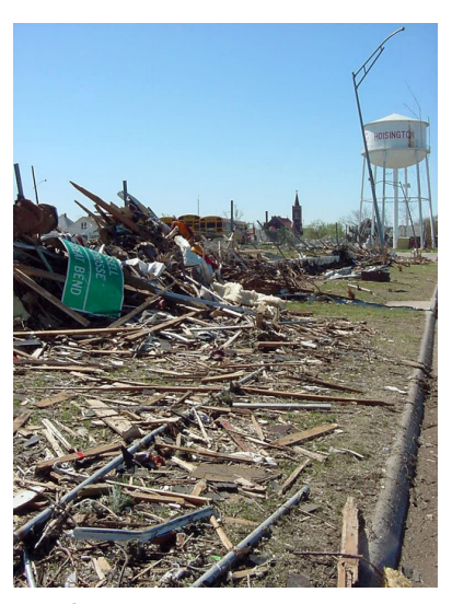
Reinforced water tower