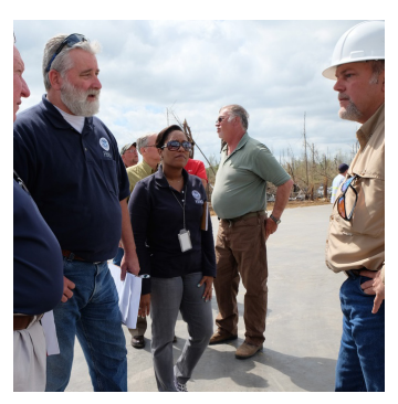
Join Local Mitigation Efforts