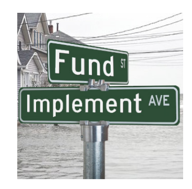
Implement and Fund Project