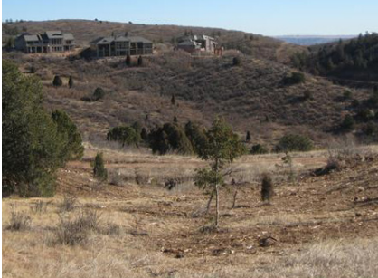
Before and after removal of at risk structures and debris