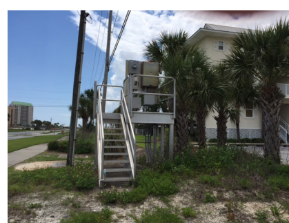
Elevate electrical panel