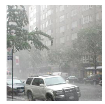
Overview Hazard Mitigation