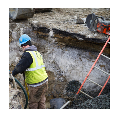
Mitigation Case Study