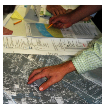
Develop Mitigation Projects