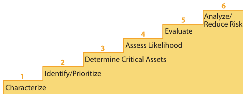
Steps for reviewing vulnerability assessments

Utilities should maintain their understanding and assessment of vulnerabilities as a “living document,” and continually adjust their protective program enhancement and maintenance priorities. Utilities should consider their individual circumstances and establish and implement a schedule for review of their vulnerabilities.